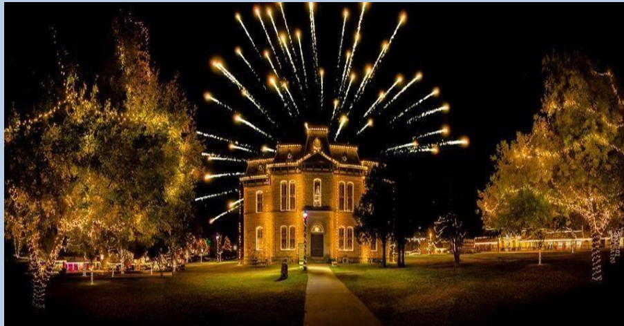
MBG 300 Main St., Suite 103, P.O. Box 1729 Blanco, TX 78606-1729

The Mike Barnes Group provides economic development consulting to companies, communities and organizations. The firm was founded in 2005 in Waco, Texas and moved to the Texas Hill Country in 2010 and located in the Old Blanco County Courthouse Preservation Society's Courthouse.