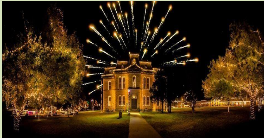
MBG 300 Main St., Suite 103, P.O. Box 1729 Blanco, TX 78606-1729

The Mike Barnes Group provides economic development consulting to companies, communities and organizations. The firm was founded in 2005 in Waco, Texas and moved to the Texas Hill Country in 2010 and located in the Old Blanco County Courthouse Preservation Society's Courthouse.